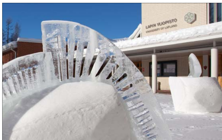
University of Lapland in winter